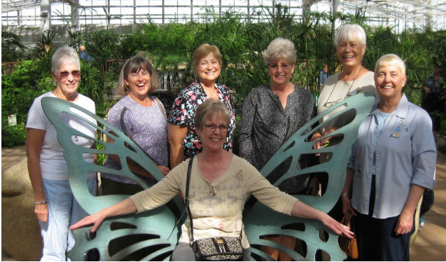
Some of our Grand RVer ladies enjoyed Butterfly Wonderland recently, one of our fun-filled Day Events!