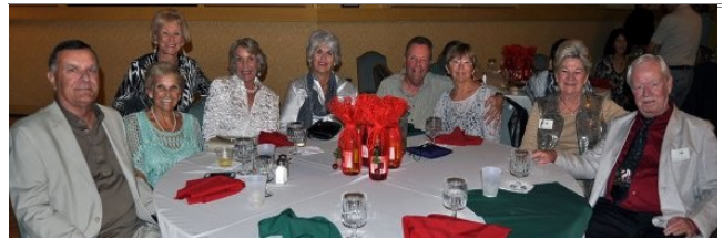
Holiday Party December 2014

When one of our members is feeling under the weather and in need of a little care and concern, that's where I step in to spread a little "Sunshine". Please let me know either by phone at 623-975-9749 or by email at mhgorden@cox.net . I will let them know that the club is concerned and thinking about them.