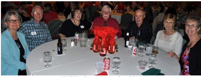
Holiday Party December 2014